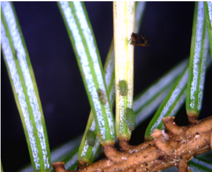
Figure 3: Spruce aphids feeding on the needles of Sitka spruce.

Spruce aphid activity is on the rise in 2016 with confirmed activity on the western side of the Kenai Peninsula. Concerned citizens from Homer reported damage associated with these aphids, with severe defoliation observed in some of the infested trees. A site visit conducted by FHP and Alaska Division of Forestry specialists in late February 2016 found scattered infested trees throughout the Homer area, varying in severity of defoliation. Damage appeared to be confined to trees in close proximity to the coast. FHP staff also surveyed for spruce aphid in the towns of Seward, Whittier, and Hope, as well as along Turnagain Arm, the Hope Highway, and the Portage area but no signs of aphid activity were observed.