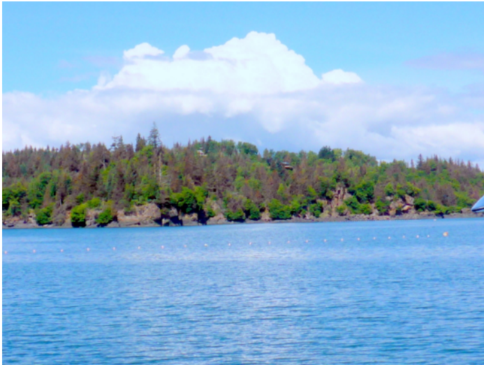
Figure 1: Sitka spruce trees heavily infested with spruce aphid in Halibut Cove.